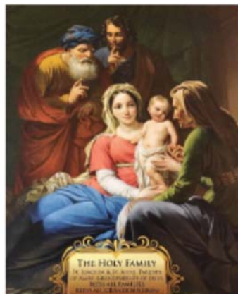
Happy Birthday, Mother Mary

Reservations required by 9/1: catholicgrandparentsolmc@gmail.com